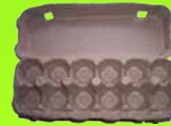
Paper Egg Cartons