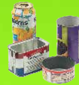
Aluminum, Tin, Steel Cans