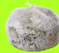
Shredded Paper in Clear Bags