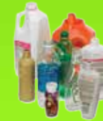
Plastic Containers Labeled #1-7