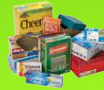
Cereal Boxes and Paperboard