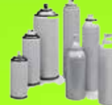
Empty Aerosol Cans